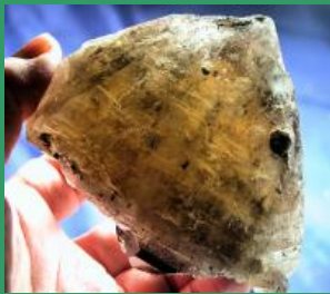
Smoky Ametrine for Placing the Ethereal into the Physical

One of the key elements in Spiritual advancement is to balance it with physical expression ... to teach others ... spread the word even if it's only by example. Spiritual advancement isn't just something we each do ... it is something we all must do so that humans, as a species, advance into those 26,000 years. Remember balance and centering? If you are balanced and centered, your advancement shows in all that you do,