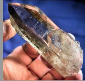
Hotspot Smoky for Transmutation

As with the heart, we store much within our bodies as a result of what we are physically and emotionally exposed to from chemicals to radiation to toxic attitudes and experiences. Many people have experienced firsthand what happens when they cleanse too rapidly in that they often release more than the body and its many levels can cope with. So the key is not just releasing, but knowing what to release and how to do it. Through an active program of transmutation, we can detoxify in a meaningful way without upsetting the balance of the energies. As an example, it is always good to get rid of a negative energy, but unless done properly, you just turn it loose to "re-infect". It will keep coming back like a nasty rash. On