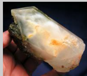
Amphibole for Perception and Centering

Sometimes we go full tilt towards Spiritual enlightenment and find ourselves literally in la-la land. What we missed is that at the end of the day, we are still products of this Earth and have a physical expression to balance. Grounding is the crucial part of the effort. It keeps us real, relative and expressive. When we are well-balanced, there will be a sense of calm and knowing. Maintaining that "center" helps us to advance more quickly and in a more deliberate manner.