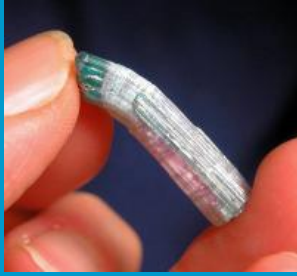
Pariaba Tourmaline for Heart Opening and Expression

The heart is literally the gateway between the physical (and the lower Chakras) and emotional expression (and the higher Chakras). It is here that we store many of our emotions about friends, family, relationships, significant others. All the hurts of the past, all the slights, the highs, the lows ... it's all there. Unless addressed, it will manifest through the years into physical disease. Unless released, we allow these negative things to rule our lives and in turn, hamstring our own Spiritual advancement. We aren't