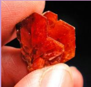
Vanadinite for Focus